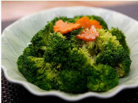
◀ 74, 蒜蓉西蘭花