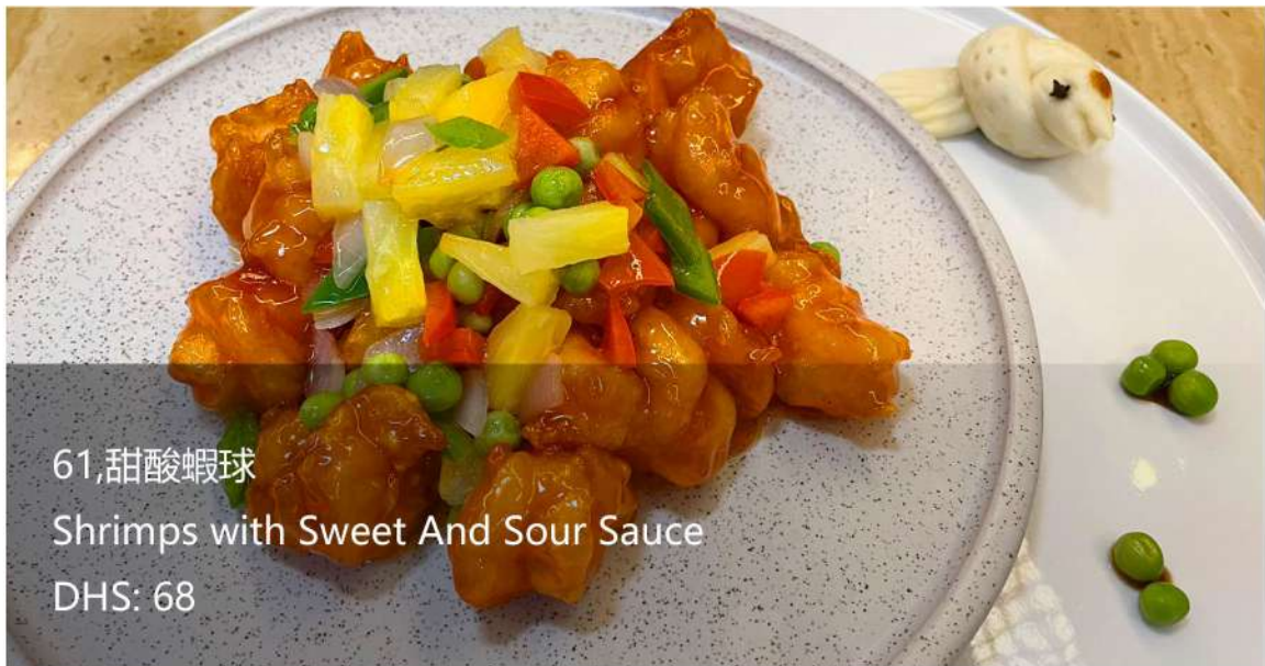
61, 甜酸蝦球 Shrimps with Sweet And Sour Sauce DHS: 68