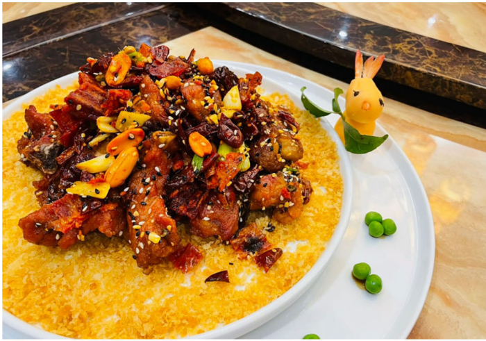
C11. 本邦八寶辣醬 "Shanghai" Style Eight Delights DHS 58