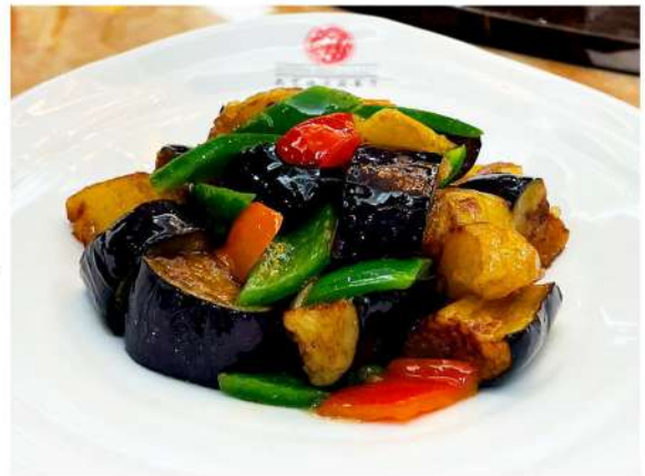
75, 東北地三鮮 ▶

Stir-Fried Green Pepper with Potato and Eggplant