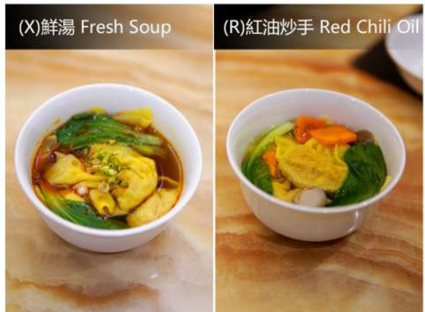
34,雲吞湯 Wonton Soup