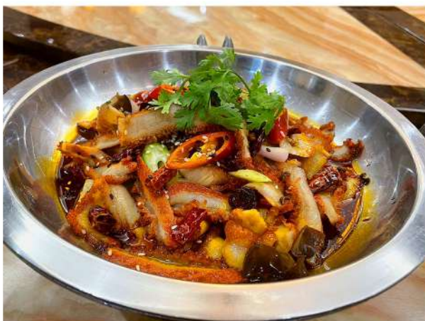
53, 川式幹鍋牛肚 🌶️🌶️🌶️ "Szechuan" Style Beef Tripe with Chili in Clay Pot DHS: 58