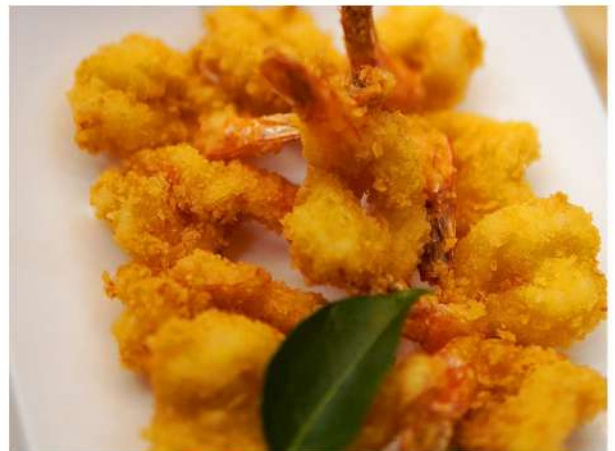
63, 香炸鳳尾蝦 Deep-Fried Crispy Prawns DHS: 68