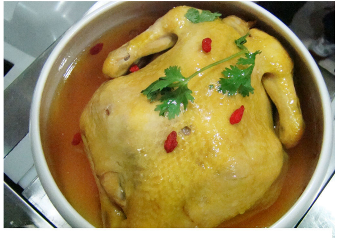
C9. 中華雞煲 Whole Spring Chicken "Chinese Style" in Clay Pot DHS 88