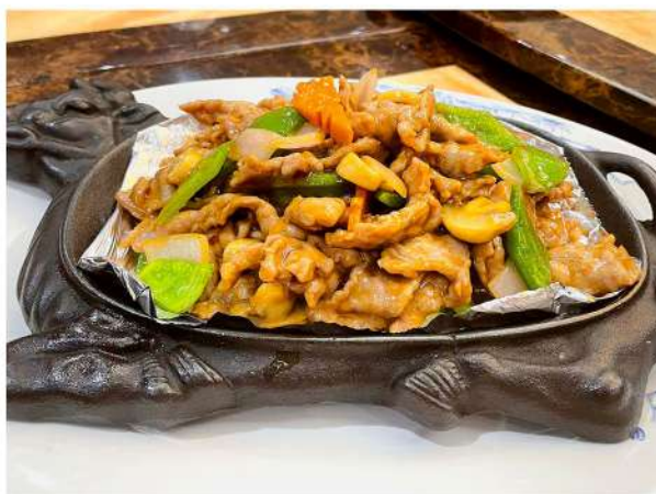
52, 鐵板蠔油牛肉片 Wok-Fried Beef with Oyster Sauce in Hot Sizzling Plate DHS: 58