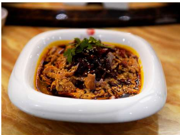
51, 川式水煮牛肉 🌶️🌶️🌶️ "Szechuan" Style Boiled Beef Fillet in Hot Chili Sauce DHS: 58