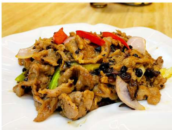
54, 豉椒爆炒羊肉 🌶️ Lamb Fillet with Black Bean Sauce, Pepper and Chili DHS 58