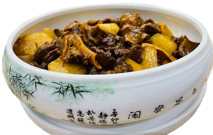
C16. 廣式蘿蔔牛筋牛腩煲 Cantonese-Style Braised Beef Tendons and Brisket with Radish DHS 158