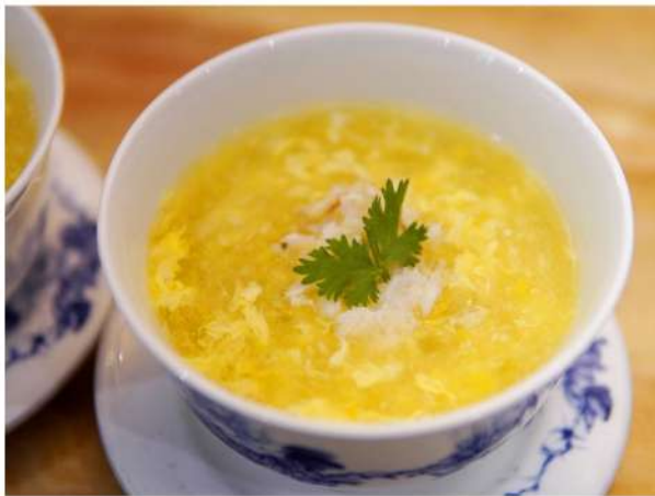
33,玉米羹 Sweet Corn Soup