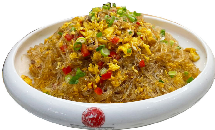
C14. 金秋桂花粉絲 Sautéed Cabbage with Glass Noodle DHS 48