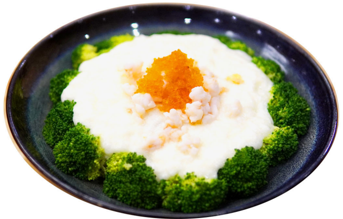
C13. 魚籽蝦仁滑鮮奶 Shrimps with Fresh Creamy Milk DHS 78