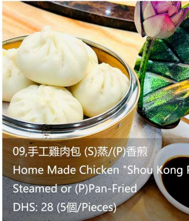
09, 手工雞肉包 (S) 蒸 / (P) 香煎 Home Made Chicken "Shou Kong Pao" (S) Steamed or (P) Pan-Fried DHS: 28 (5個/Pieces)