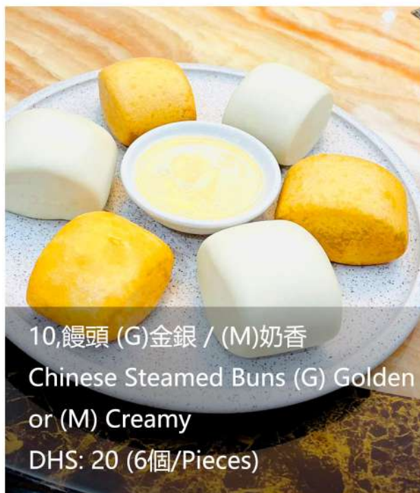
10, 饅頭 (G) 金銀 / (M) 奶香 Chinese Steamed Buns (G) Golden or (M) Creamy DHS: 20 (6個/Pieces)